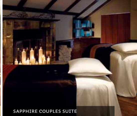
SAPPHIRE COUPLES SUITE