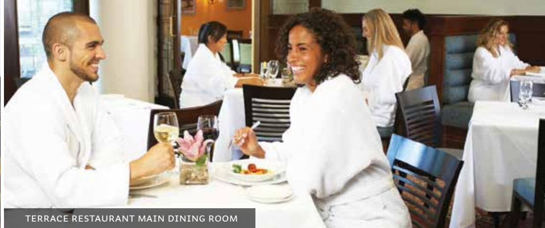
TERRACE RESTAURANT MAIN DINING ROOM