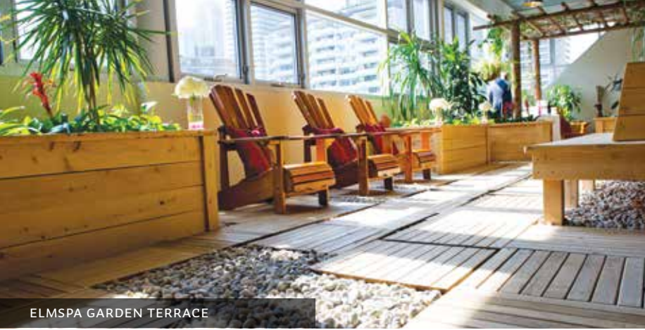
ELMSPA GARDEN TERRACE