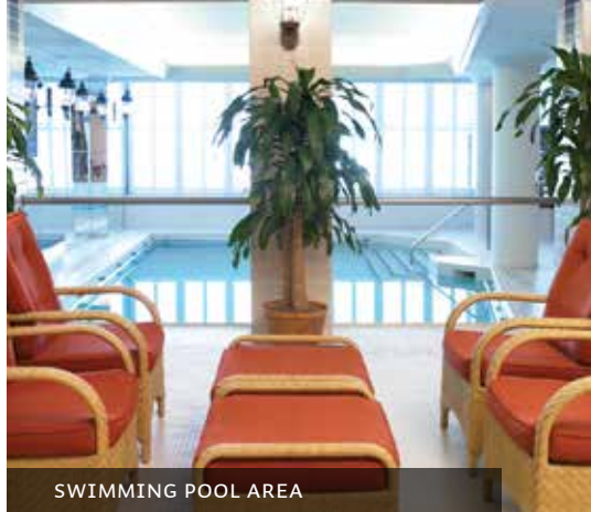
SWIMMING POOL AREA