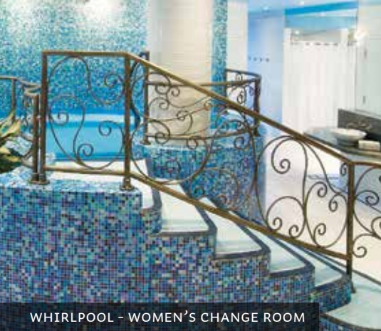
WHIRLPOOL - WOMEN'S CHANGE ROOM